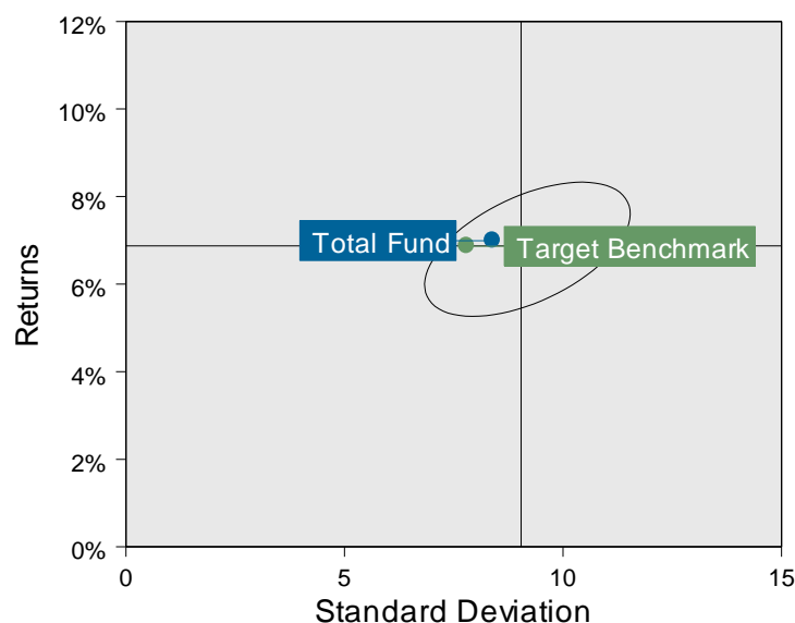
Callan Public Fund Spons- Mid (100M-1B) (Gross) Annualized Seven Year Risk vs Return

Cumulative Annualized as of June 30, 2020