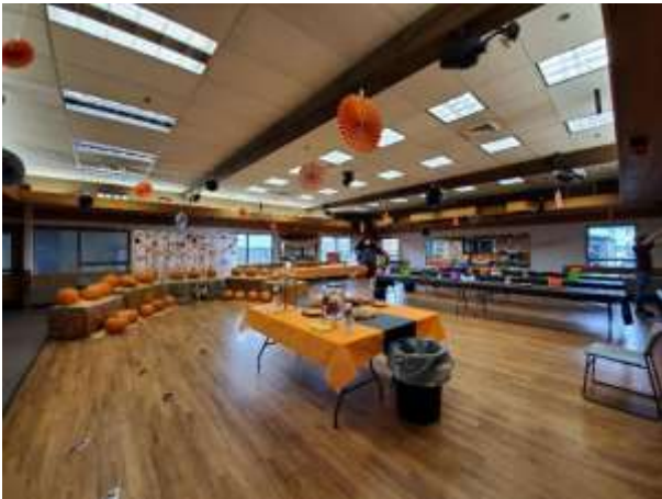
2019 Kids' Pumpkin Carving Set-up

Pre-registered activity focused for youth. The facility was transformed for this event. The program consisted of a 'pumpkin patch' photo booth, 'creation station', 'cutting and gutting station', snacks, refreshments and instructional pamphlets for seed roasting.