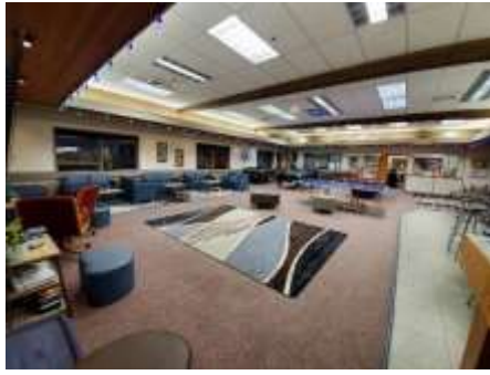
2019 Rec Center Before & During Clean-out