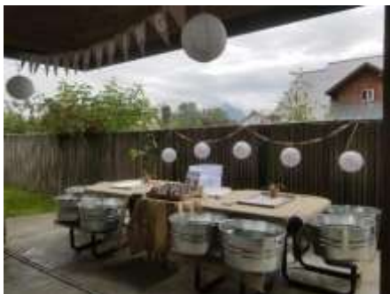
2019 Kids' Gold Panning Set-up

Fall Explorers and Earth Explorers were a series of play-based sensory activities for parents with little ones under the age of six. Each week highlighted a unique theme. Participation was excellent and we received positive feedback and praise from the community. We hope to continue programming similar activities in the future.