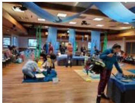
2019 Earth Explorers – Oceans Day