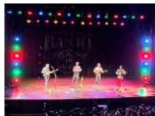
Pictured: The Valdez Art's Council kicked off their 2019 – 2020 season with the act "We Banjo Three" featuring fiddle, guitar, mandolin and banjo from Ireland in our theatre.