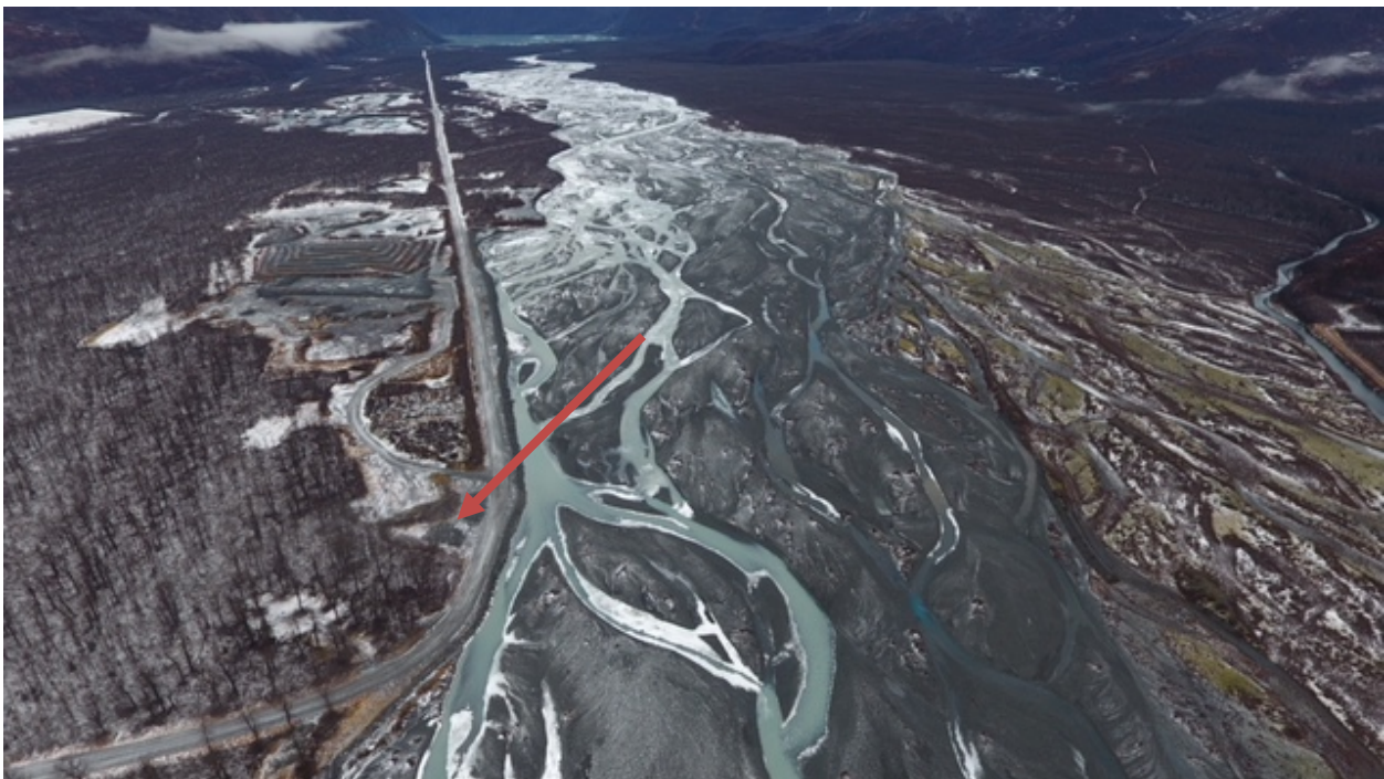
Glacier Stream stockpile area