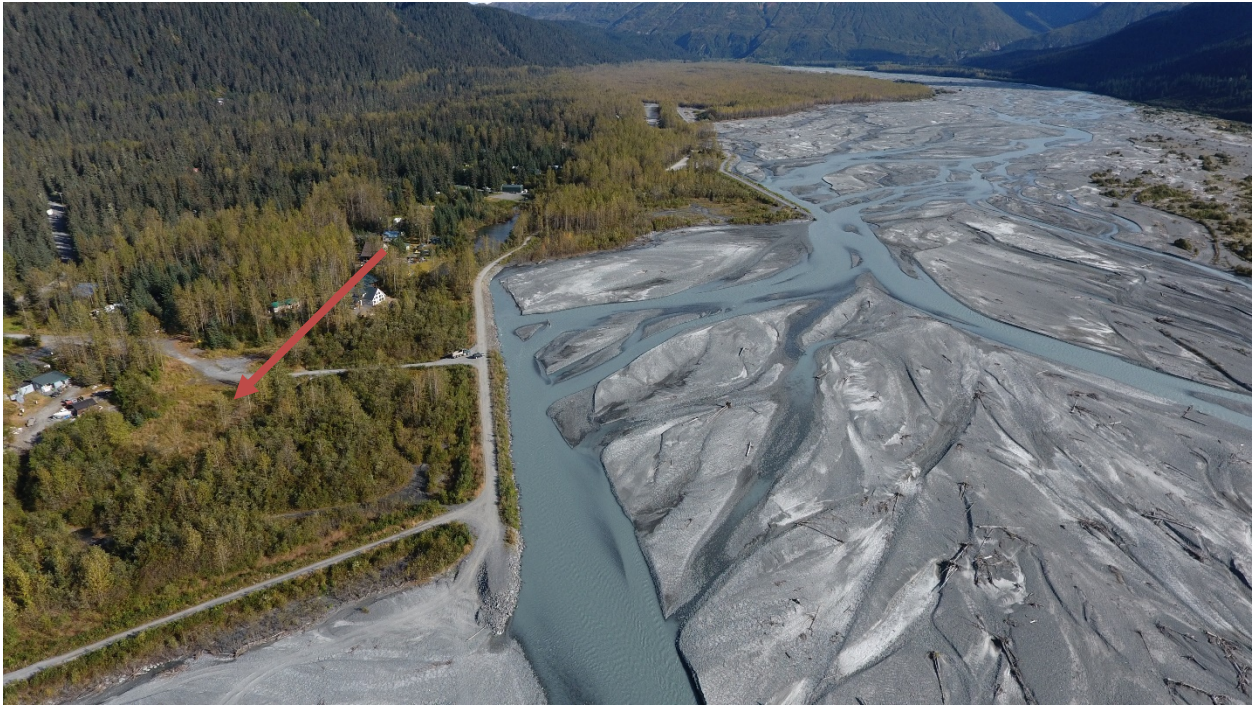
Alpine Woods stockpile area