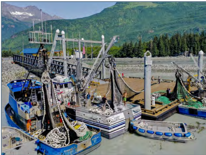
Seiners crews repair nets at the new Drive-Down Float.