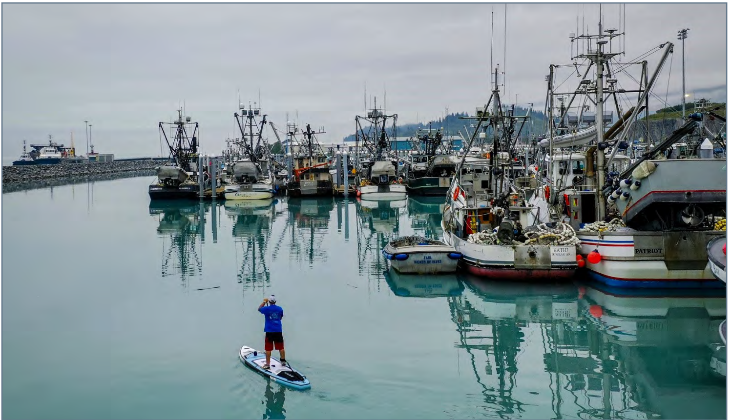
A one-person watercraft operator conscientiously practices "No Wake" speed near the big boats at R-Float.