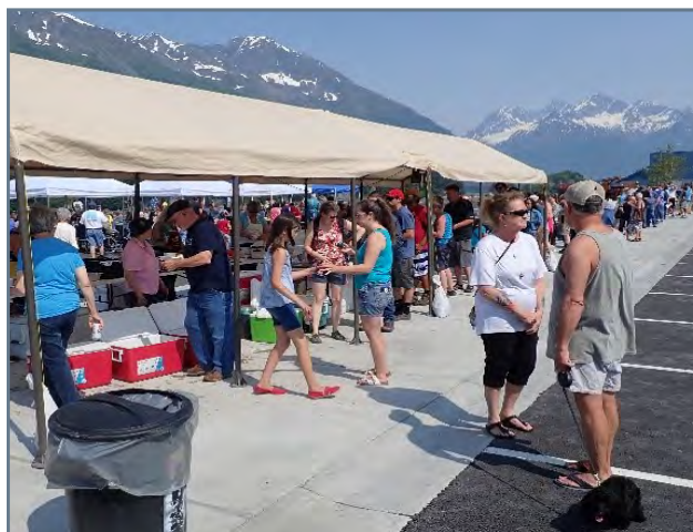
Lots of people, in food line above, enjoyed the beautiful day and the Grand Opening for the new harbor