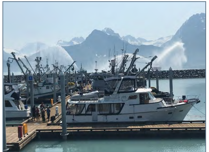
T-Float during Grand Opening; water cannons on SERVS tugs celebrate the event outside the harbor