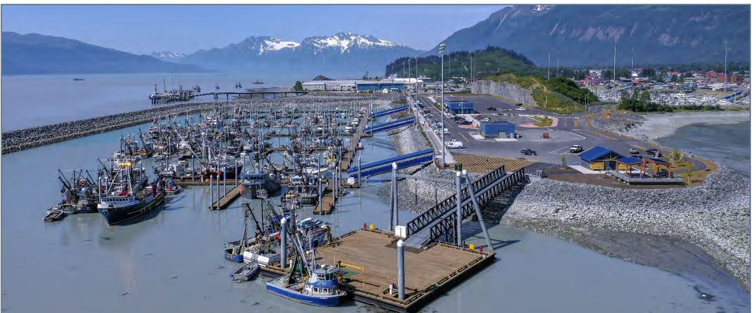
One week after the Grand Opening; seiners using the Drive-Down Float. Tenders moored at R-Float; Large Seiners at S and T floats; mixture of vessels beyond Photo courtesy of J. Talbott.