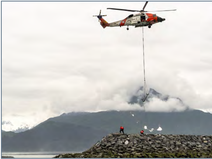
Coast Guard helicopter lowering a Navigation Aid to crew for installing at harbor entrance.