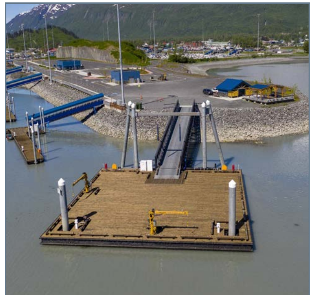
Drive Down Float and bridge completed. PPM pile driving barge removed.