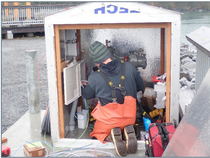
Installing heater in backflow preventer enclosure at the DD Float