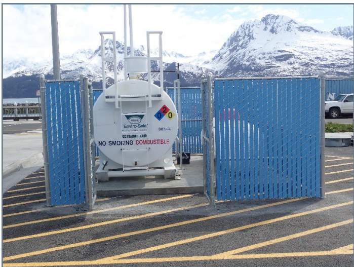
Fence around fuel oil and propane tanks next to Warehouse building