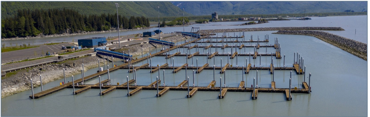
Mooring basin looking East. Entrance at upper right. Drive Down Float upper left.