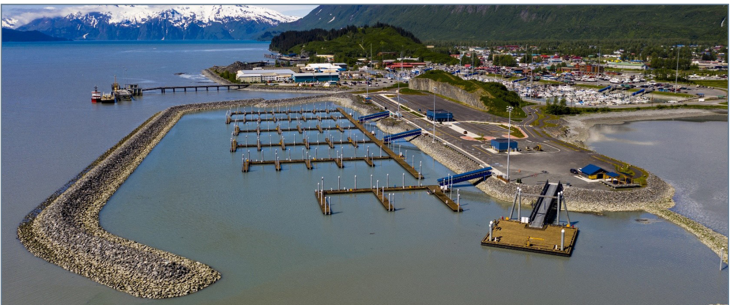
Harbor view looking West. Entrance lower left. Sediment berm lower right.