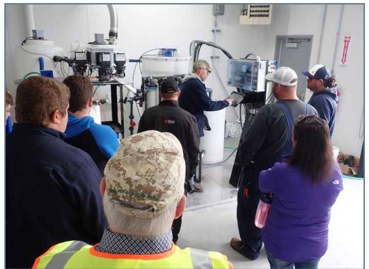
Oil Trap bilge water treatment system training