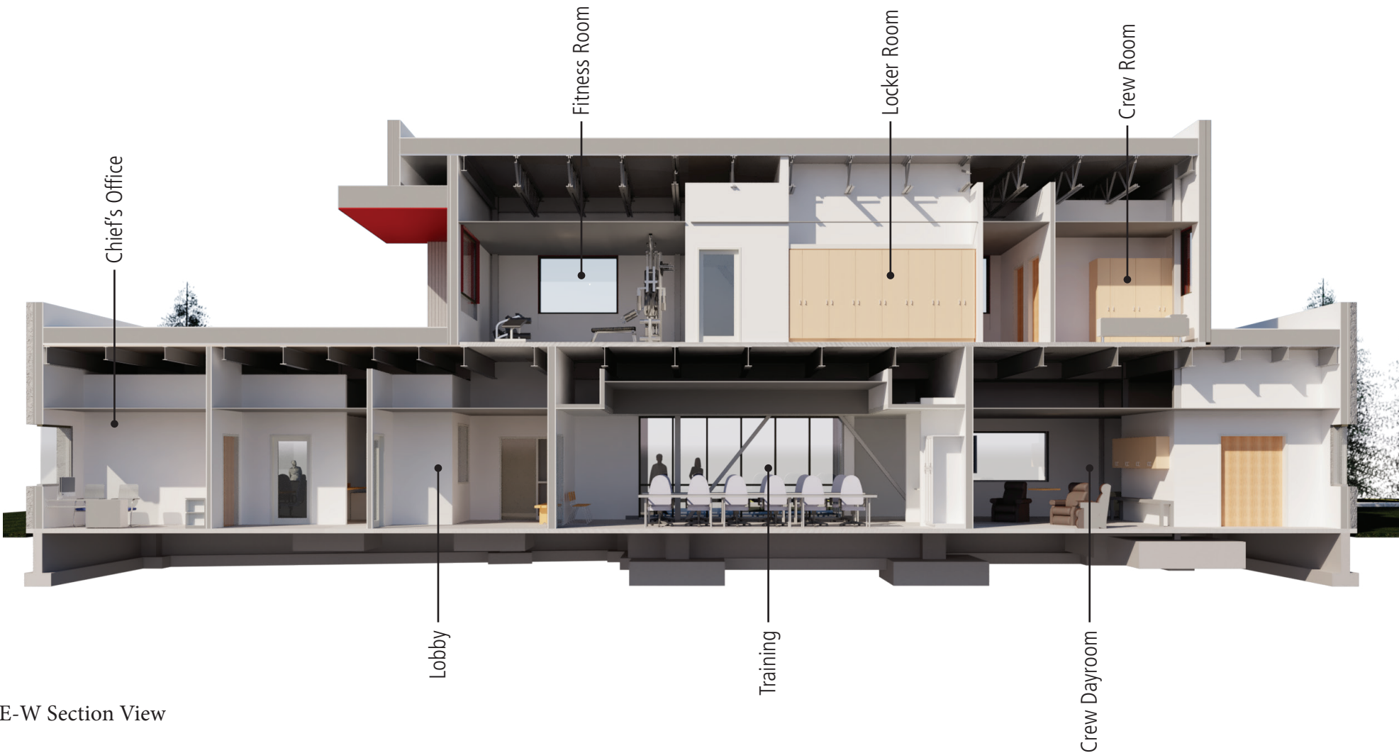
E-W Section View