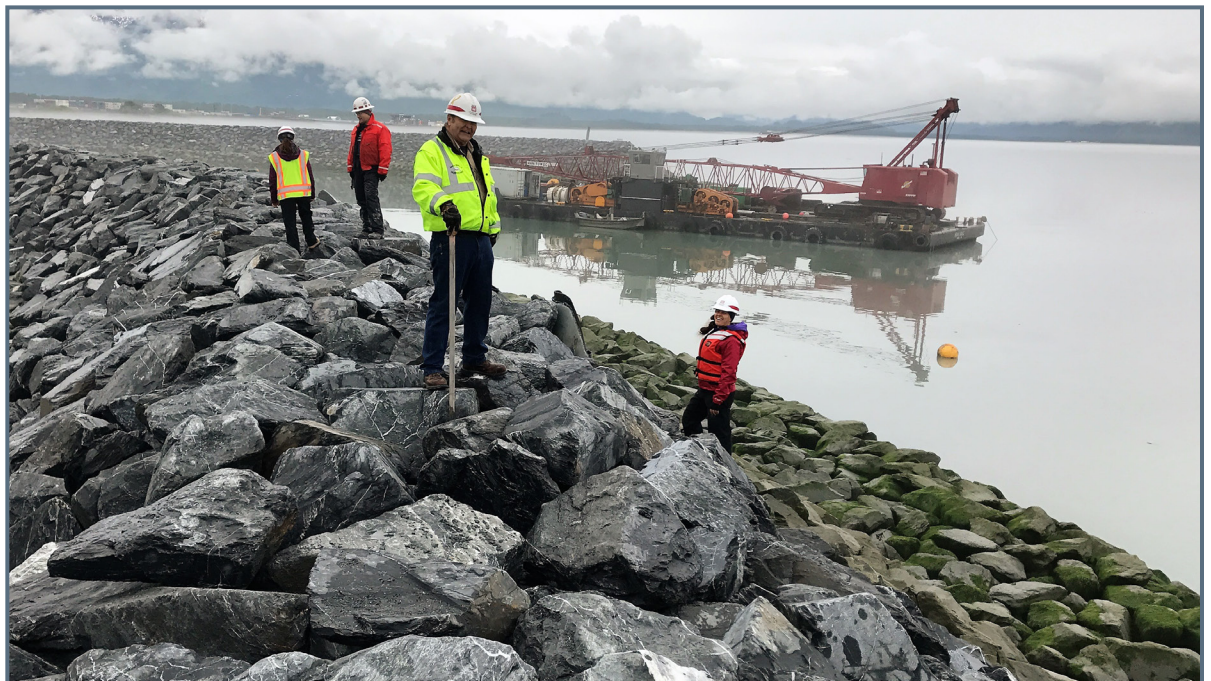
USACE – WMC Pre-Final Inspection South Breakwater