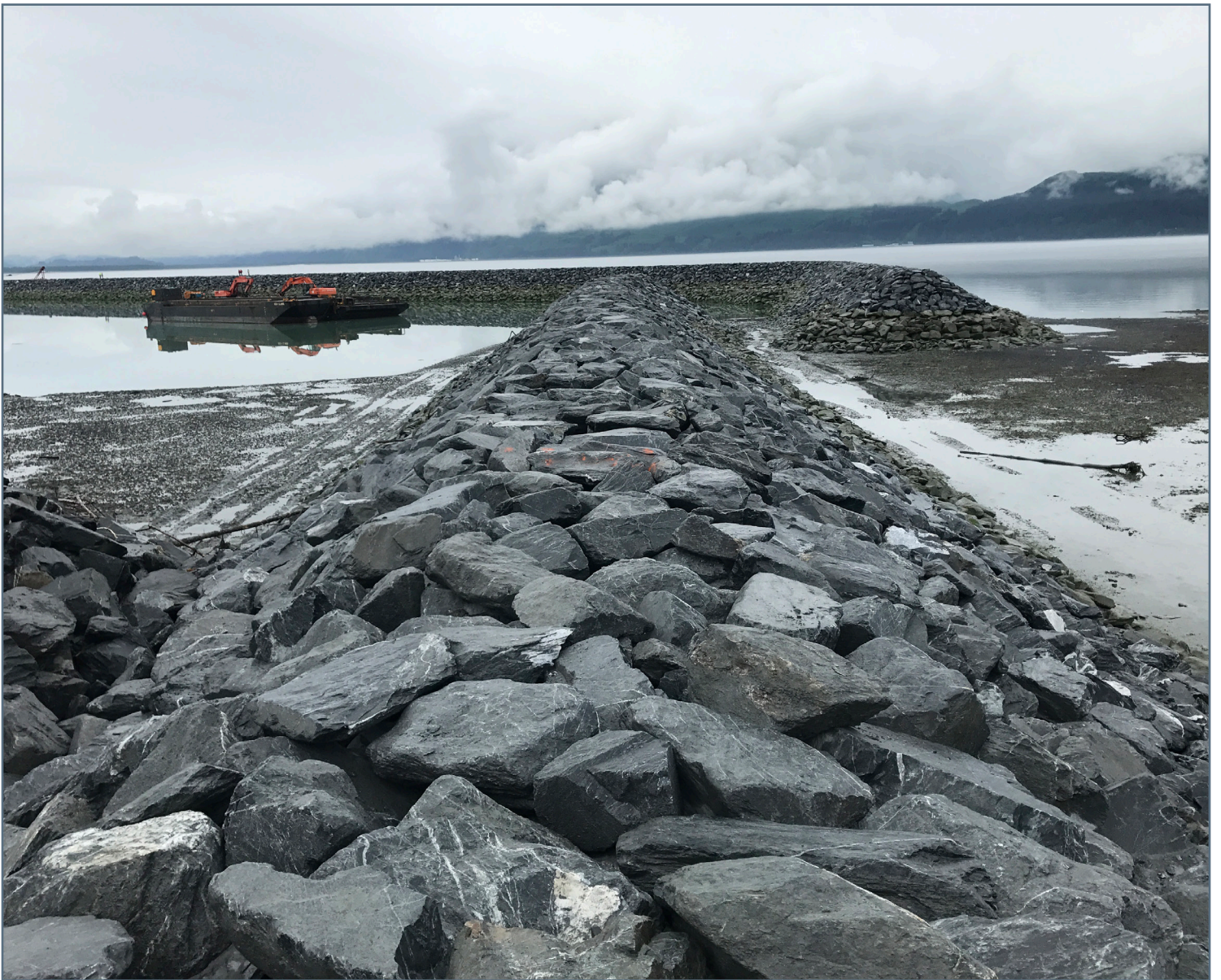
USACE – WMC Pre-Final Inspection Stub (West) Breakwater looking toward South Breakwater