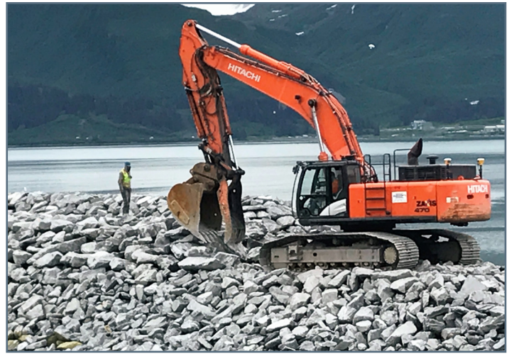
Placing armor rock on Stub Breakwater