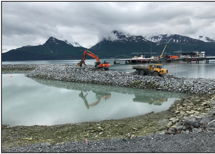
Completing Stub Breakwater