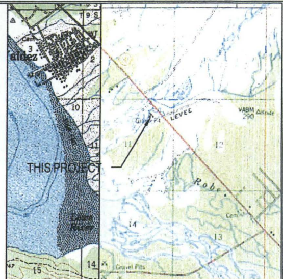
VICINITY MAP 1" = 1 MILE