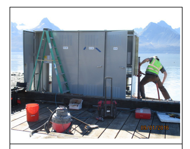
Setting cabinet for main meter and east Ramp #3