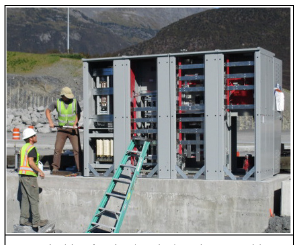
Back side of main electrical equipment cabinet