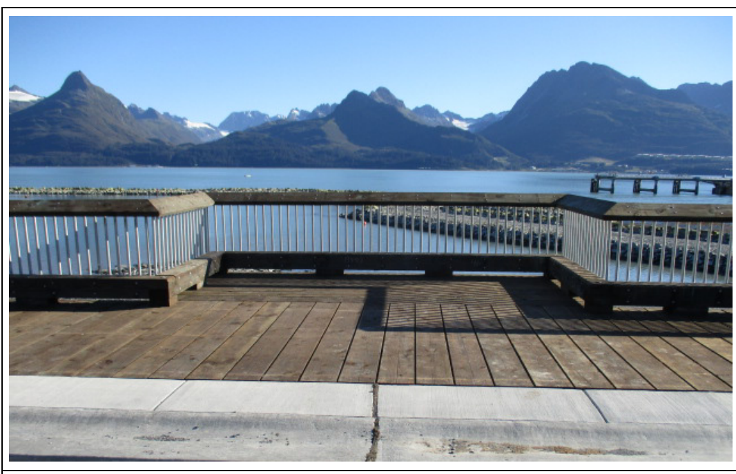
Concrete curb and sidewalk, boardwalk decking, bullrail and handrail at West Rest Area

EMC inspected general progress, work layout, tested soil compaction and sampled and tested concrete. Photographs by ARCADIS and EMC unless noted.