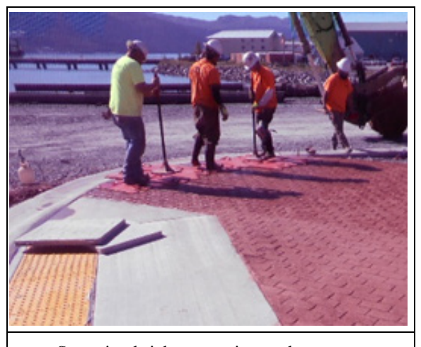
Stamping brick pattern into red concrete