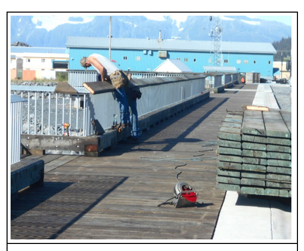
Attaching timber top plate to guardrail assembly