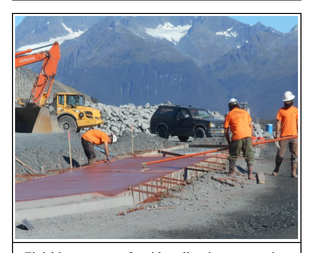
Finishing concrete for sidewalk prior to stamping