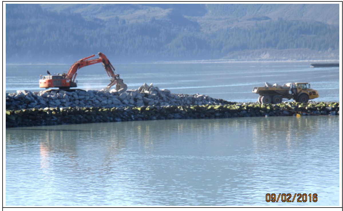
Western Marine truck delivering armor rock for excavator to place near entrance end of south breakwater