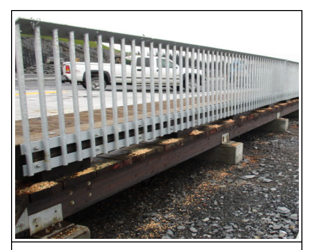
Boardwalk guardrail attached at bottom to bullrail

CONSTRUCTION PROGRESS REPORT No. 48 AUGUST 29, 2016 - SEPTEMBER 4, 2016