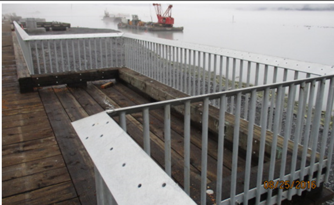
Guardrail with top plate attached to bullrail at rest area. Timber handrail will be bolted on the top plate.