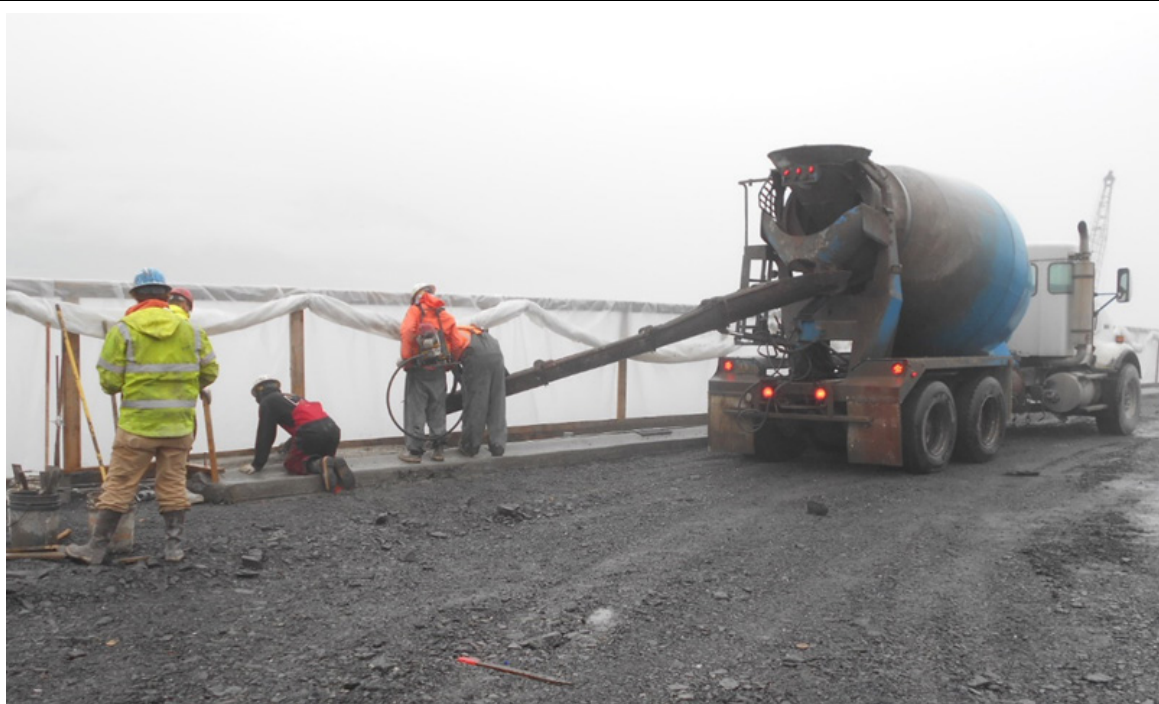
Placing concrete for separation sidewalk between curb and boardwalk