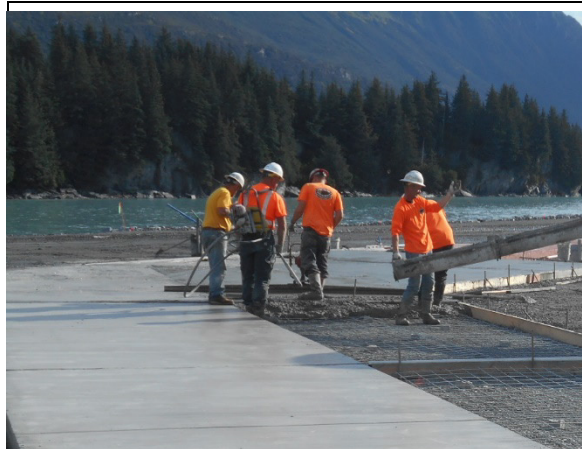
Placing and leveling concrete for sidewalk