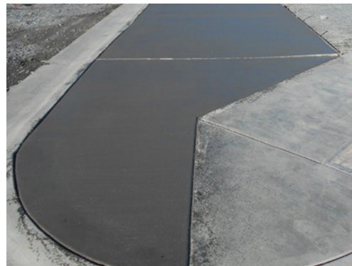
Freshly finished concrete for sidewalk