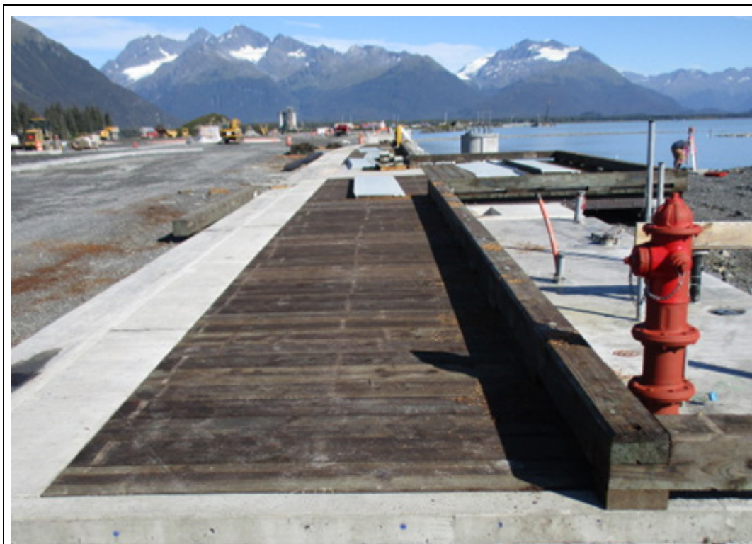
Concrete curb and sidewalk, boardwalk deck with bullrail, and concrete utility pad

EMC inspected general progress, work layout, tested soil compaction and sampled and tested concrete.