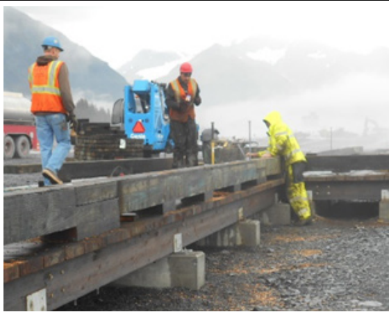
Installing bullrail on top of boardwalk deck