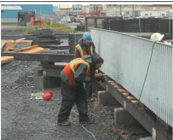
Drilling holes to bolt guardrail to bullrail