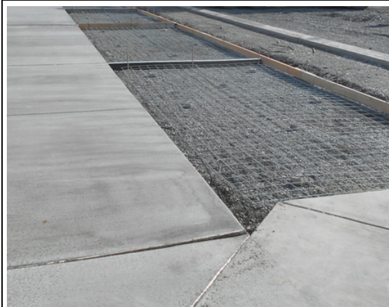
Edge form, control joint and mesh for sidewalk