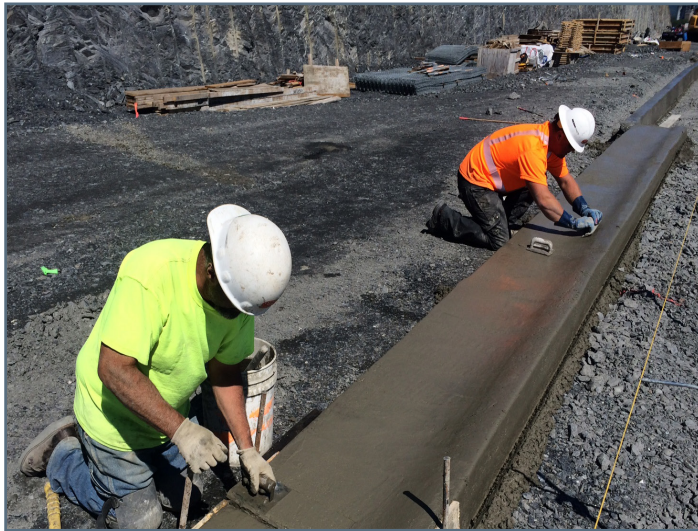
Cutting contraction joint and hand finishing curb and gutter