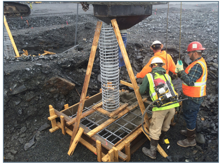
Placing concrete for base of pier to support picnic area canopy