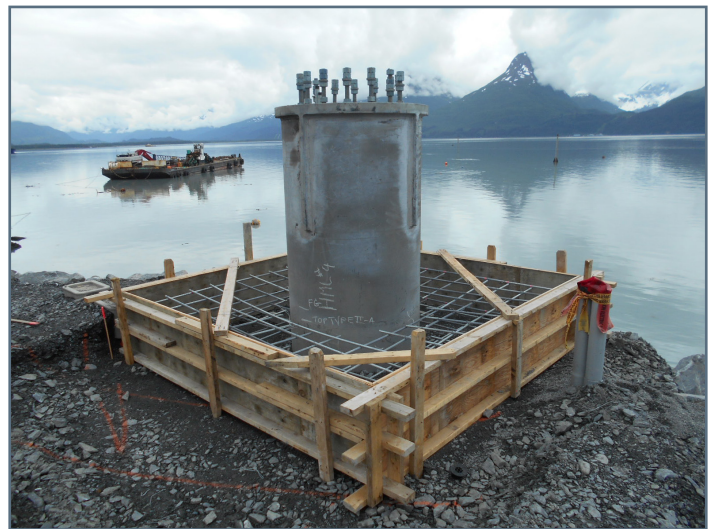
Form and rebar for concrete slab around high mast light foundation