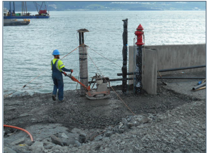
Compacting fill around water system risers and fire hydrant near ramp