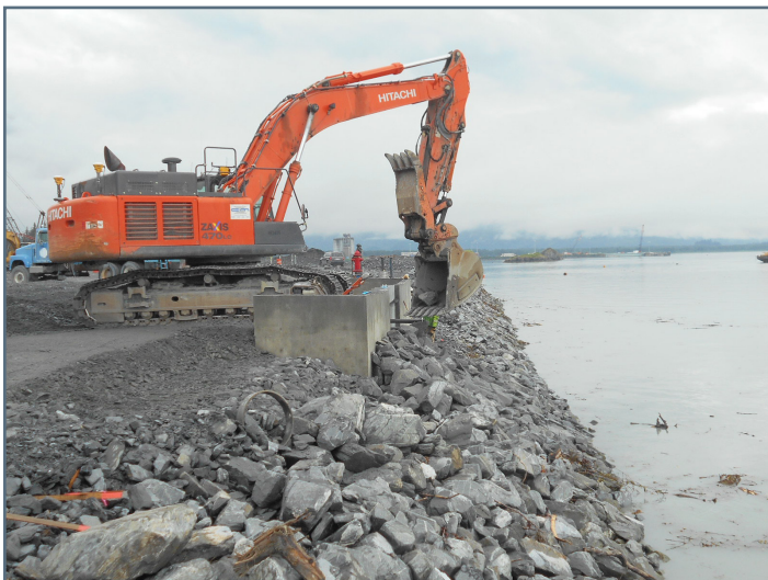
Placing riprap on slope at retaining wall for ramp