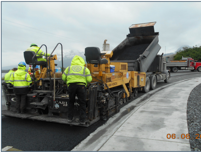
Paving between existing road and new curb & gutter