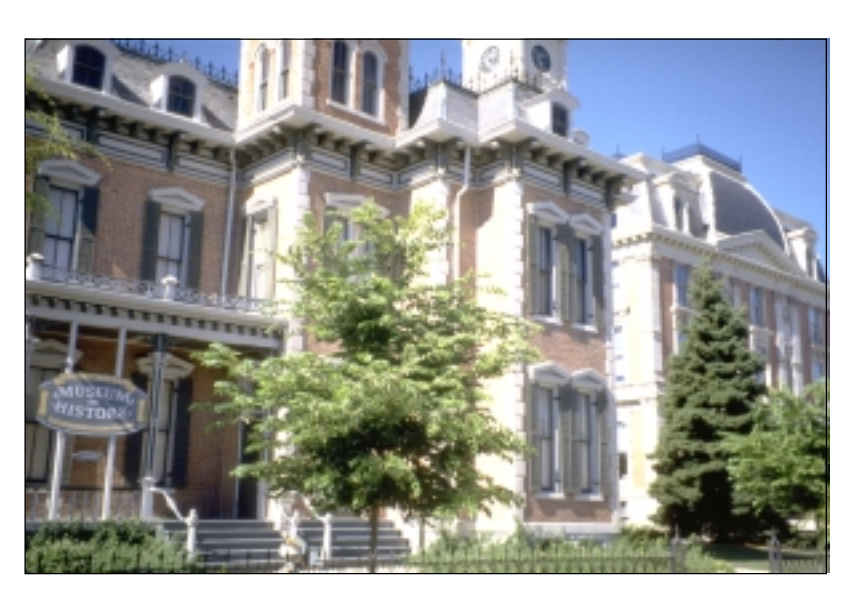
An accessible side entrance was added to this historic facility.

If alterations are being made to a historically significant property, however, these changes must be made in conformance with the ADA Standards for Accessible Design, ("the Standards"), 28 C.F.R. Part 36, § 4.1.7, or the Uniform Federal Accessibility Standards, ("UFAS") § 4.1.7, to the maximum extent feasible. If following either set of standards would threaten or destroy the historical significance of the