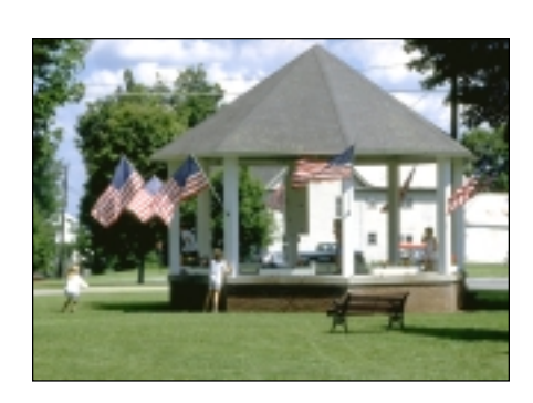
City programs held in this municipal gazebo are covered by the ADA.

This document contains a sampling of common problems shared by city governments of all sizes that have been identified through the Department of Justice's ongoing enforcement efforts. The document