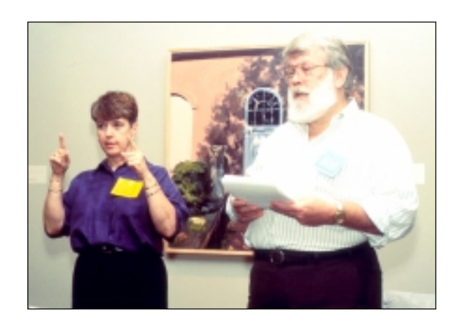
A sign language interpreter at a public meeting may be needed to provide effective communication for people who are deaf.

provide appropriate auxiliary aids and services for people with disabilities (e.g., qualified interpreters, notetakers, computer-aided transcription services, assistive listening systems, written materials, audio recordings, computer disks, large print, and Brailled materials) to ensure that individuals with disabilities will be able to participate in the range of city services and programs. City governments must give primary consideration to the type of auxiliary aid or service that an individual with a disability requests. The final decision is the government's.