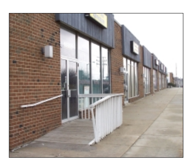
City zoning policies were changed to permit this business to install a ramp at its entrance.

City governments are required to make reasonable modifications to policies, practices, or procedures to prevent discrimination on the basis of disability. Reasonable modifications can include modifications to local laws, ordinances, and regulations that adversely impact people with disabilities. For example, it may be a reasonable modification to grant a variance for zoning requirements and setbacks. In addition, city governments may consider granting exceptions to the enforcement of certain laws as a form of reasonable modification. For example, a municipal ordinance banning animals from city health clinics may need to be modified to allow a blind individual who uses a service animal to bring the animal to a mental health counseling session. 28 C.F.R. § 35.130(b)(7).