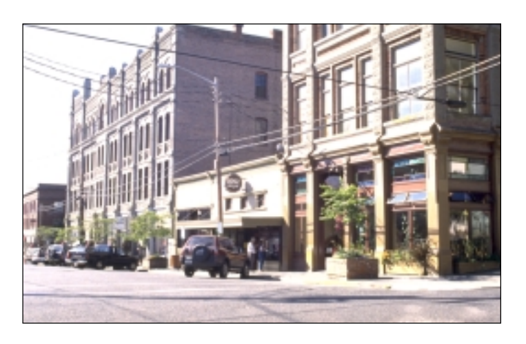
Curb ramps providing access to streets and sidewalks are a basic city service.

Access to civic life by people with disabilities is a fundamental goal of the Americans with Disabilities Act (ADA). To ensure that this goal is met, Title II of the ADA requires State and local governments to make their programs and services accessible to persons with disabilities. This requirement extends not only to physical access at government facilities, programs, and events — but also to policy changes that governmental entities must make to ensure that all people with disabilities can take part in, and benefit from, the programs and services of State and local governments. In addition, governmental entities must ensure effective communication — including the provision of necessary auxiliary aids and services — so that individuals with disabilities can participate in civic life.