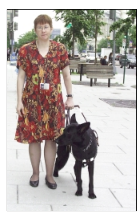
City policies, including those affecting service animals, should be reviewed during the self-evaluation.

If a city that employs 50 or more persons decides to make structural changes to achieve program access, it must develop a transition plan that identifies those changes and sets a schedule for implementing them. Both the self-evaluation and transition plans must be available to the public. 28 C.F.R. §§ 35.105, 35.150(d).