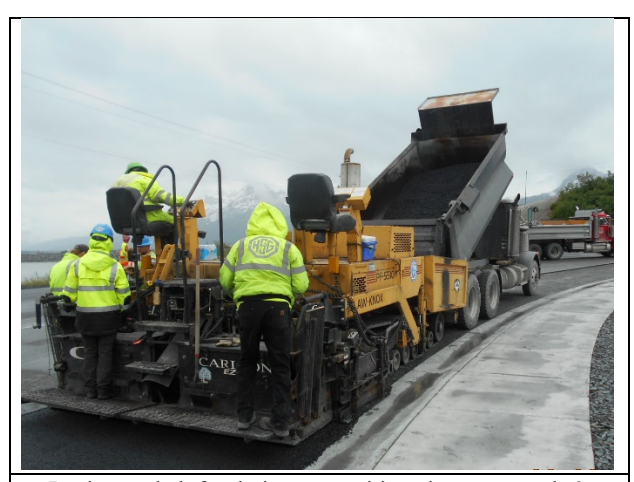
Laying asphalt for drainage transition along new curb & gutter and patch excavation at tie-ins to sewer/water mains