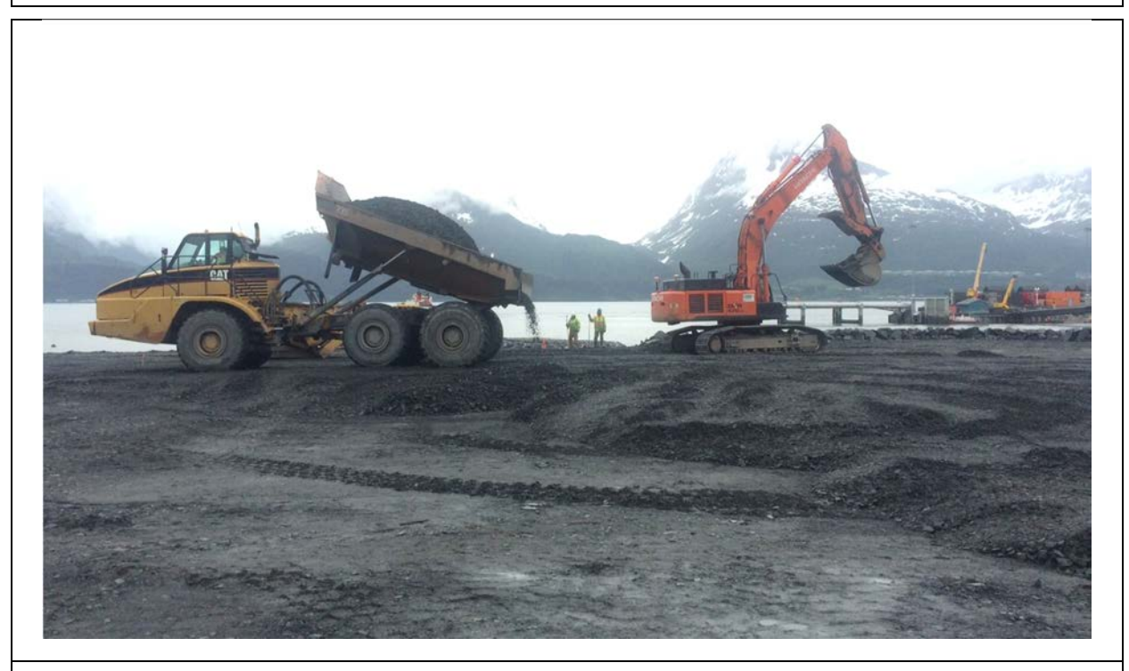
Classified material crushed at Sea Otter is delivered to the site by articulated truck for filling to final grade