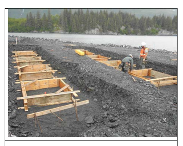
Placing forms for canopy foundations at East picnic area