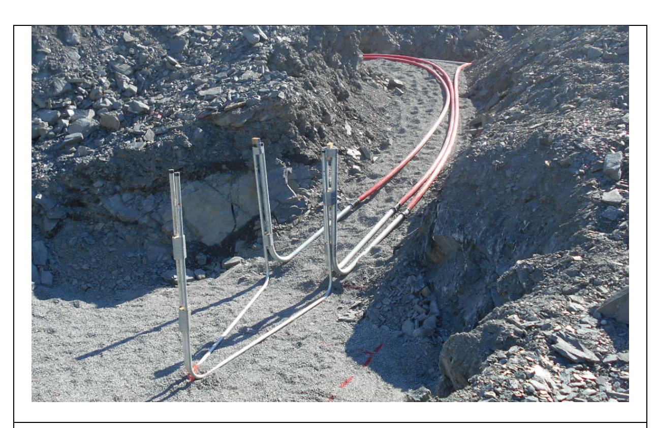
Rigid risers and flexible electrical conduit installed on bedding material in common trench

CONSTRUCTION PROGRESS REPORT No. 36 June 6, 2016 – June 12, 2016