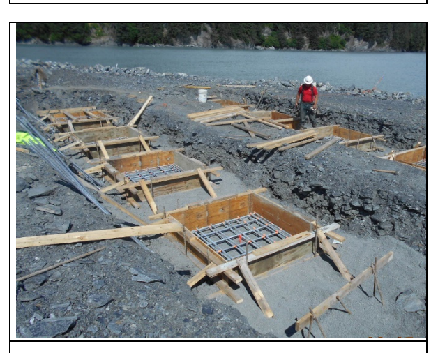
Reinforcement for canopy foundations at East picnic area