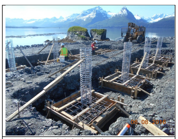
Bracing rebar spirals for foundation posts to support the canopy at East picnic area