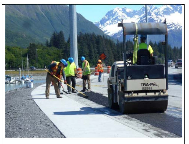
Paving transition from new curb to existing S Harbor Drive