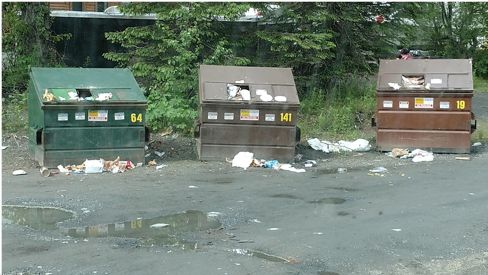
An Example of Dumpster Mess in a Residential Neighborhood