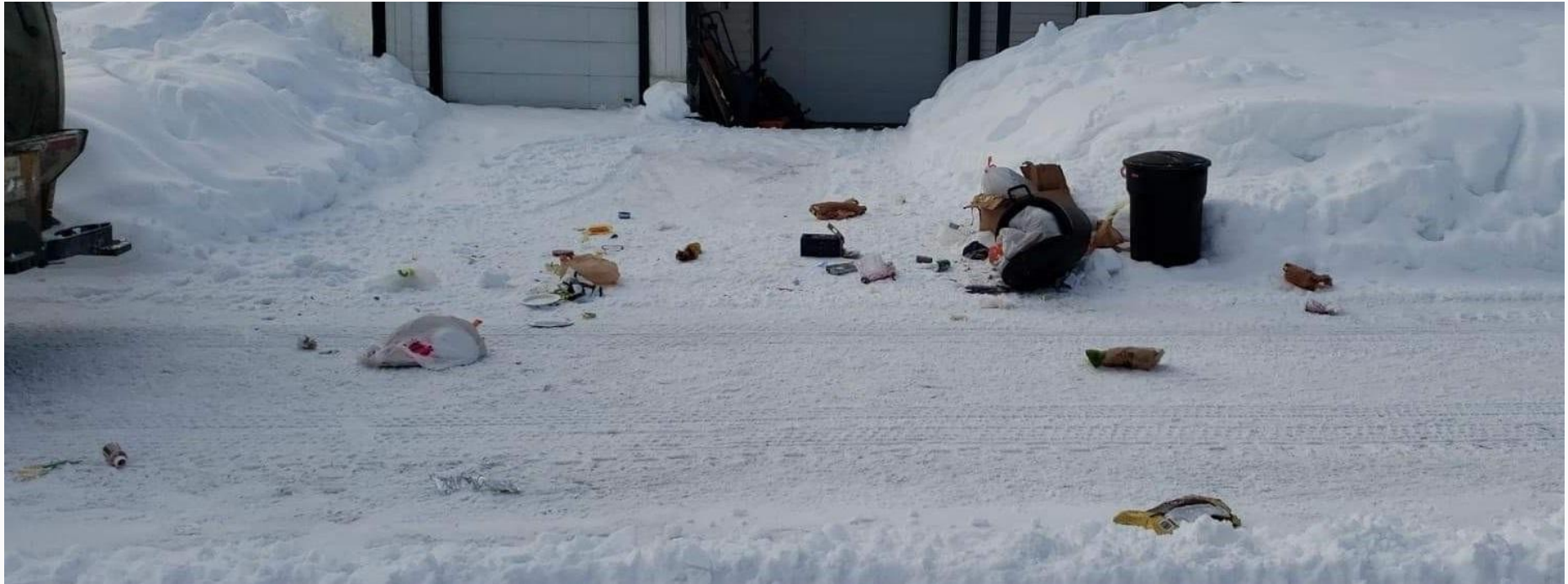
Example of what Bear Working Group recommendation would eliminate