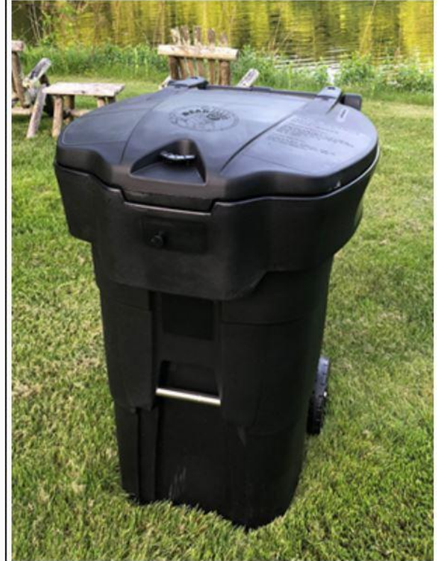
Stealth-Like Clean Simple Design