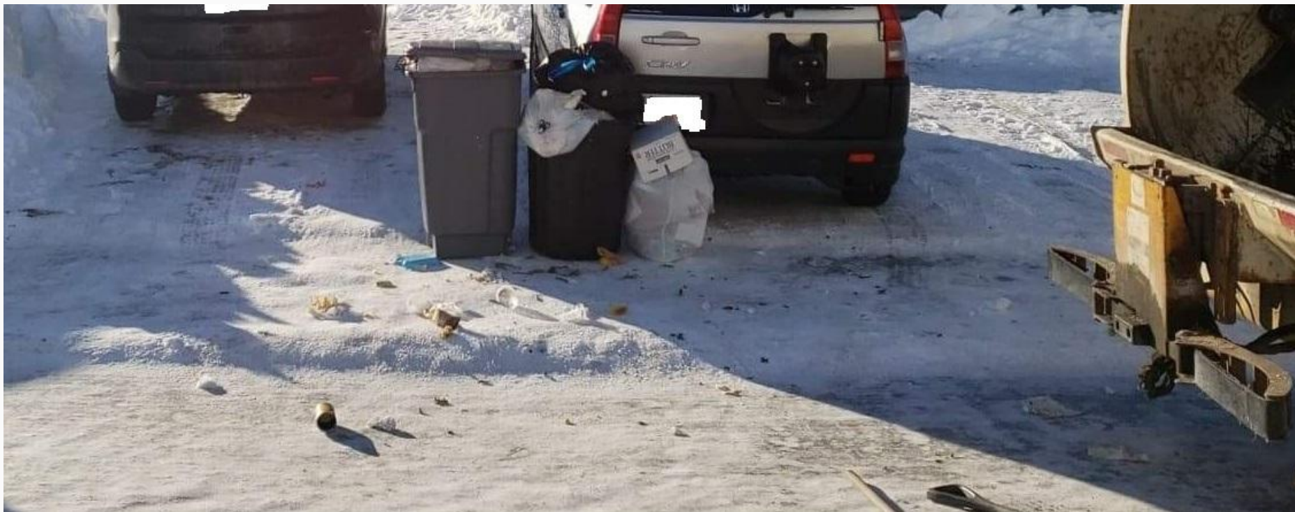
Example of what Bear Working Group recommendation would eliminate