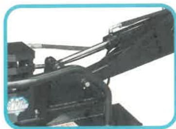
3" x 16" tilt cylinder