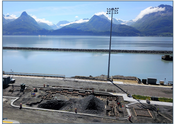
Warehouse building underground utilities, footing forms and rebar in process