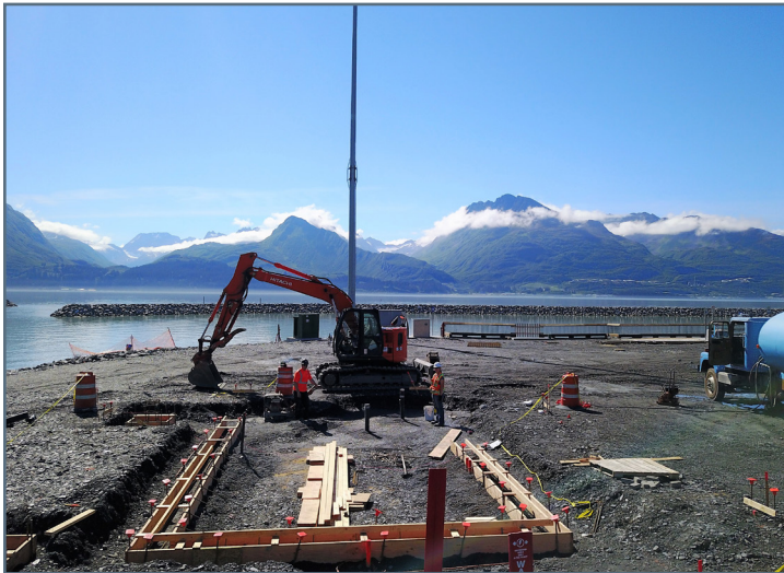
East Restroom underground utilities, footing forms and rebar in process