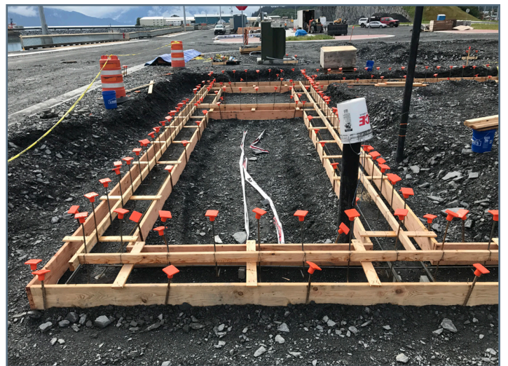
Bilgewater Treatment Building footing forms with rebar, water and sewer service risers