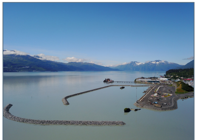
View west of breakwaters, new harbor basin, and uplands