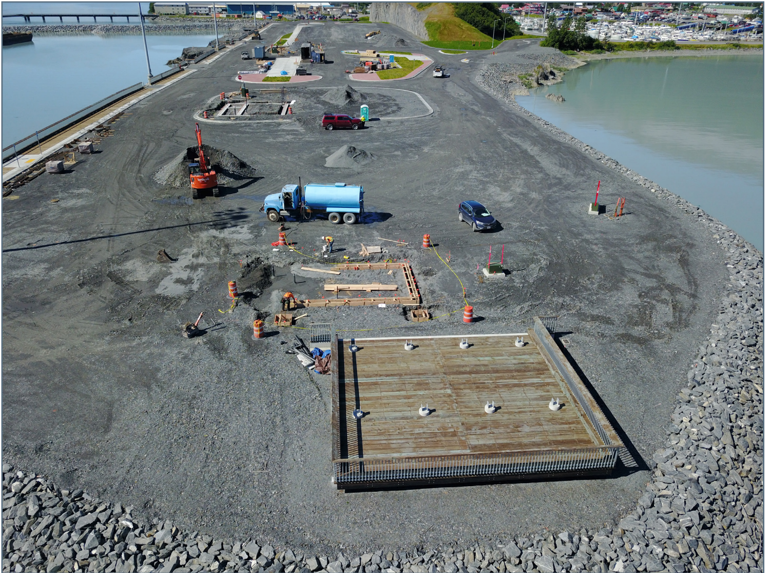
View west of uplands. East Restroom footings in process (below blue water truck). East Picnic area platform (bottom) will get canopy in Phase 2