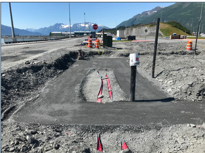
Bilgewater Treatment Building electric/telecom conduits backfilled (below marker tape); preparing for footings